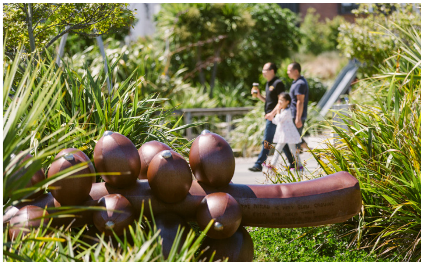
Hobsonville Point is home to a vibrant community with world-class amenities that make living both easy and enjoyable.

green fingers, you can grow your own produce in the communal vegetable gardens. Extensive cycling and walking trails hug the coast and parkways, giving you easy access to the scenic outdoors. Hobsonville Point is also home to two highly rated decile 10 schools – primary and secondary – alongside a growing retail and commercial hub. For commuters, Auckland City is an easy drive away, or catch the ferry to the CBD and arrive relaxed, whether you're heading to work or for dinner and a show.