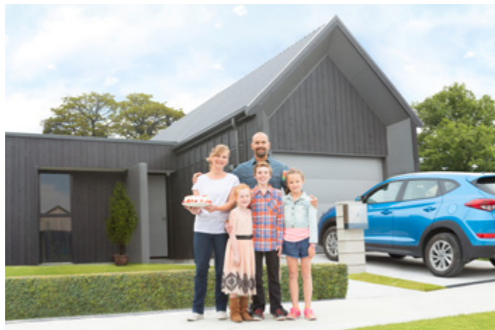
Bridesdale Farm, Queenstown

Winton's vision is to set the standard as a world-class Australasian property group creating master-planned communities that are best by design. With a strong focus on customers' needs, Winton provides a lasting legacy for generations to come by creating more sustainable, connected and vibrant urban communities.