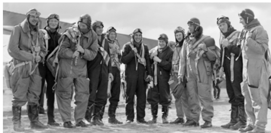
Launch Bay has a rich aviation and military history, from the impressive flying boats that once operated here to the large-scale aircraft hangars and the formal waterfront parade grounds.