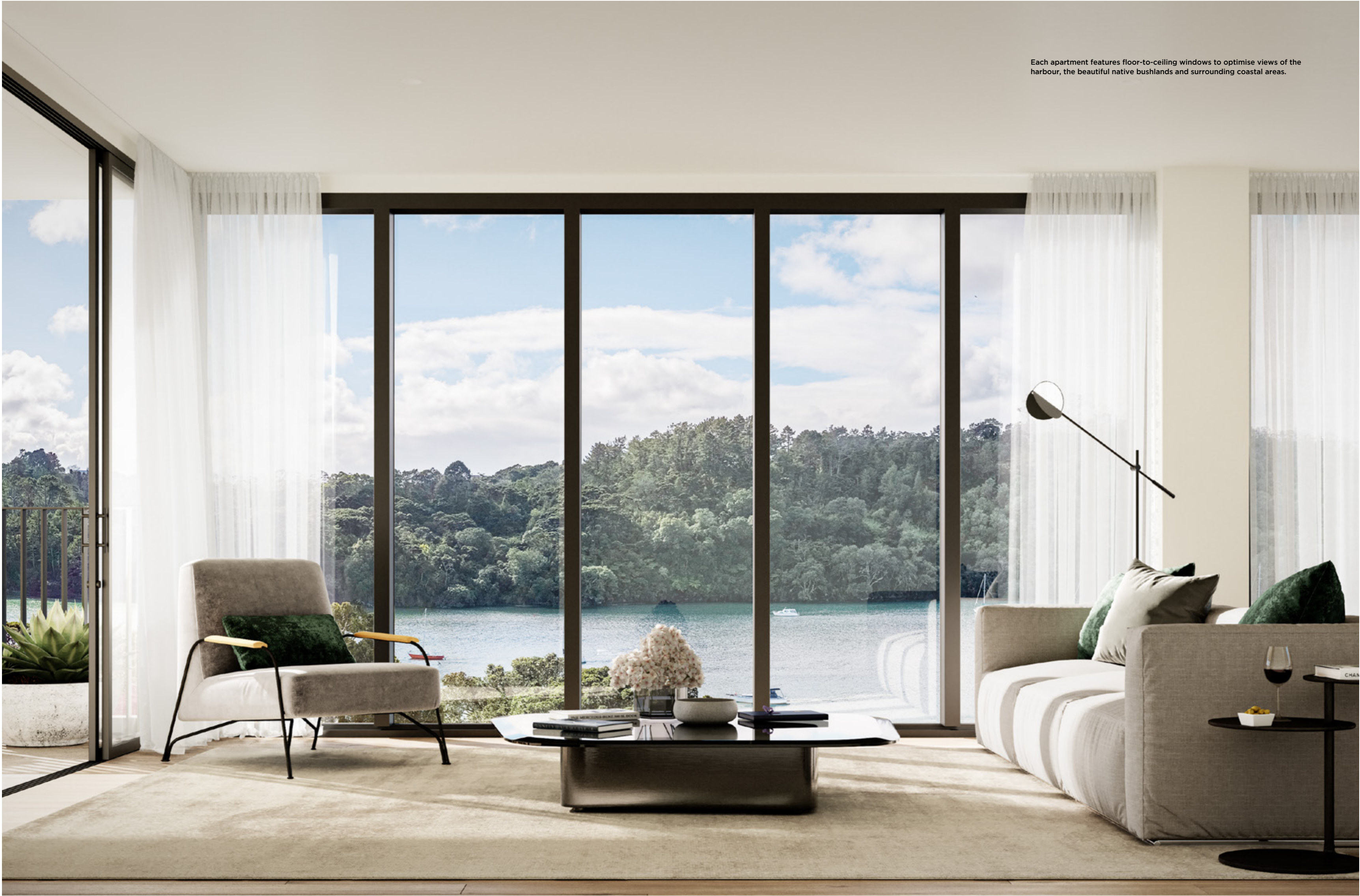
Each apartment features floor-to-ceiling windows to optimise views of the harbour, the beautiful native bushlands and surrounding coastal areas.