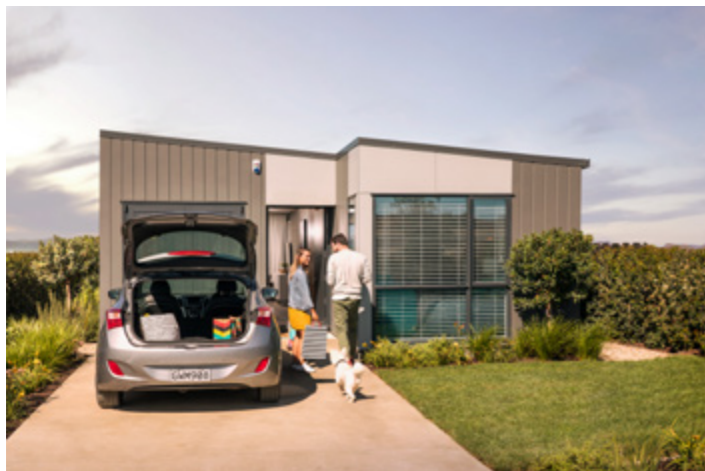
Lakeside, Te Kauwhata