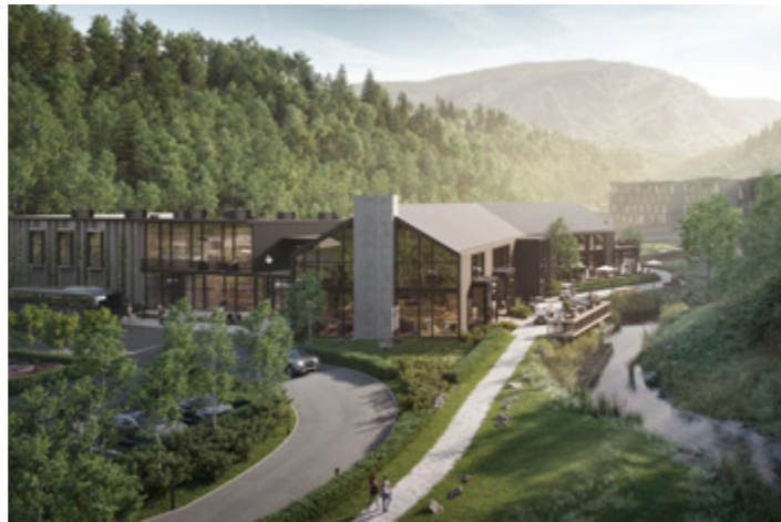
Waterfall Park, Queenstown