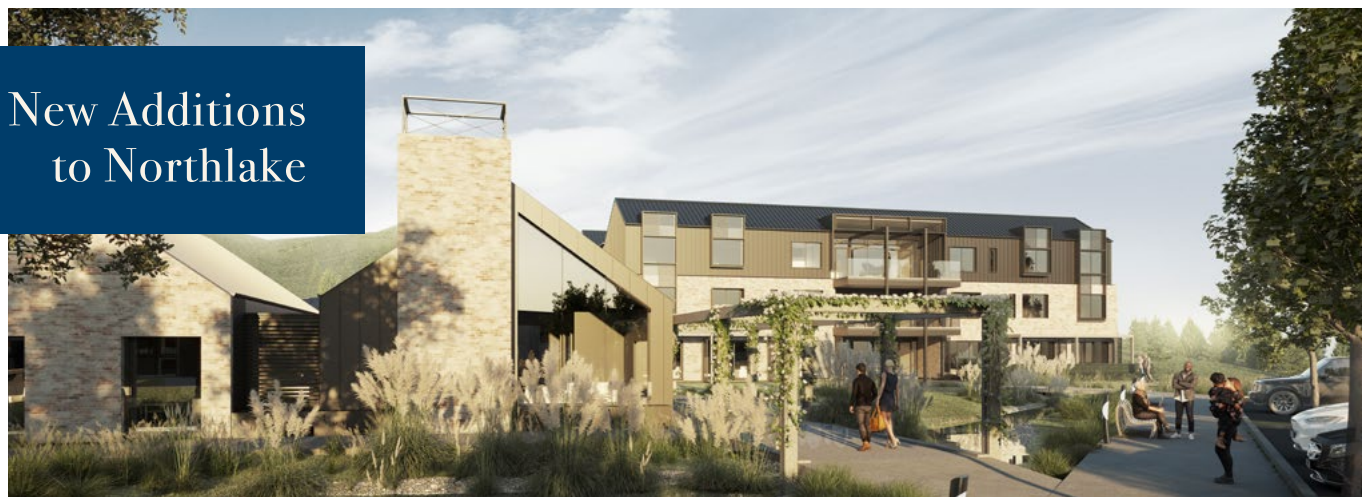
▲ NORTHBROOK WANAKA, A STUNNING HIGH-END RETIREMENT VILLAGE SET ALONGSIDE OUTLET ROAD